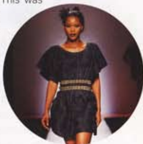
Shift dress (above) and tote bag (below) from African Mosaïque